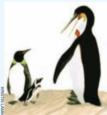
Artist Rendition of the first Paleogene penguins next to present day penguins.

TRACKING THE EBB AND FLOW OF COASTAL ENVIRONMENTALISM